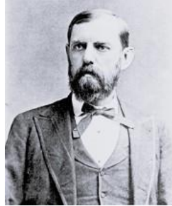
Richard F. Pettigrew